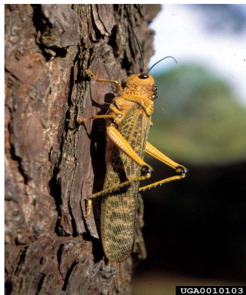
Adult Giant Brown Cricket Insecta > Orthoptera > Acrididae Tropidacris dux (Drury)